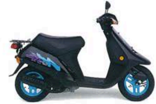
Elite 50 SR

No matter which Honda scooter you choose, you couldn't have made a more friendly choice. They all start with the push of a button. They feature automatic transmissions so you don't have to shift, ever. Electronic ignitions make them about as maintenance-free as a hammer. They let you laugh at high gas prices. And you'll probably never have to hunt for a parking space again.