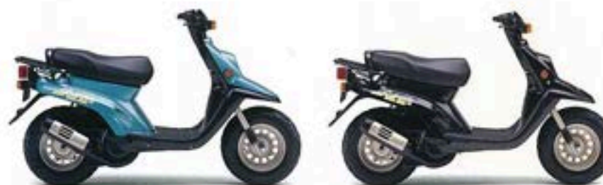
Zuma 11 Aqua or Black

Coleman Powersport Woodbridge 14105 Telegraph Road Woodbridge, VA 22192 .. 703-497-1500