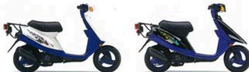
Riva Jog White/Purple or Black/Purple