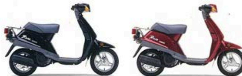
Riva Razz Dark Violet or Maroon