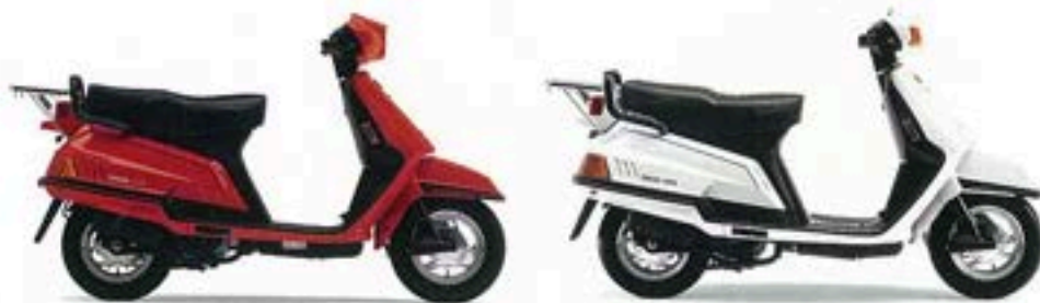
Riva 125 Red or White